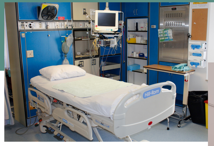
(Above): Current ICU Patient Area

(Right): Design for new, spacious ICU Patient room