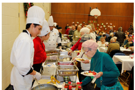
Pancake breakfast supporters make their way through the food line up

Our annual Pancake Breakfast was held on November 27. 362 supporters attended and enjoyed a delicious breakfast prepared and served by staff and students of the Crocus Plains Regional School Culinary Arts Program. Event-goers also enjoyed the musical talent of the Crocus Plains Girls' Choir.